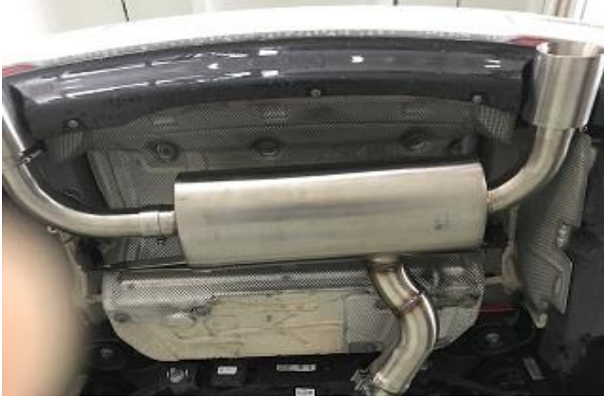
Under carriage view of exhaust installed.