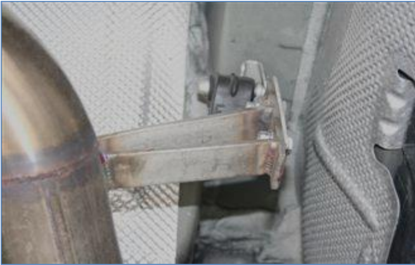
Mount and set hangers – right side