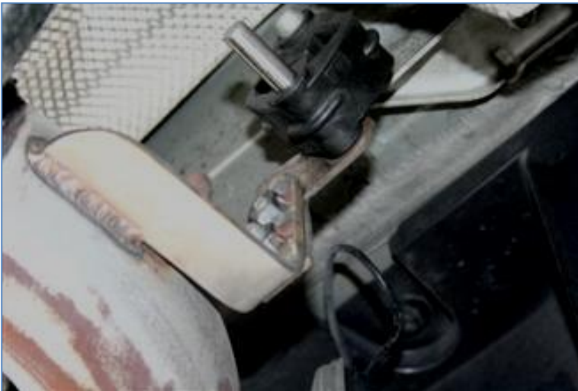
Install muffer pan onto pipe and attach left rubber mount.