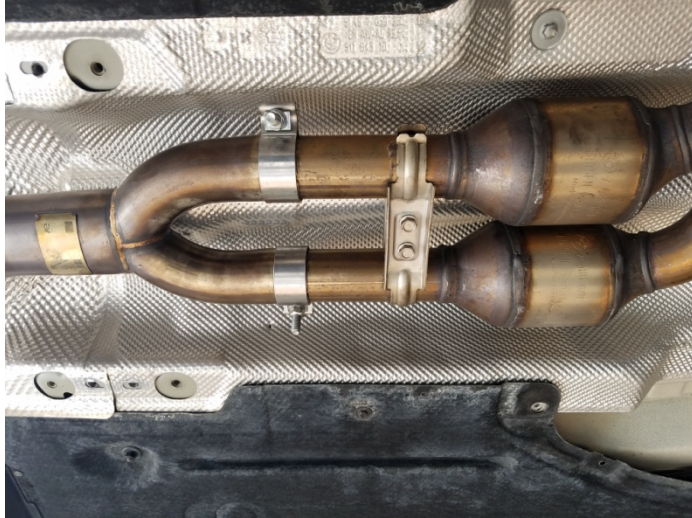
20. Mid Pipe mounted