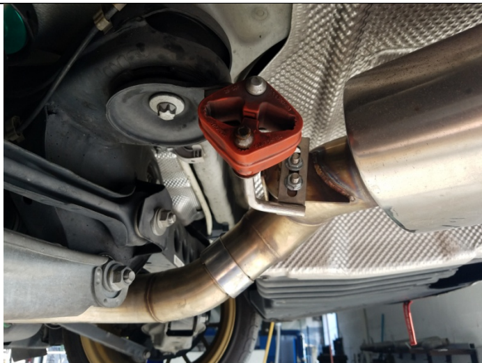
22. Slide the new exhaust or the factory rear muffler onto the Mid Pipe. Hangers will align with original rubber mounts. Insert into hangers.