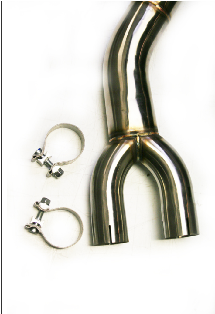
13. Mid Pipe with (2) TORCA clamp 2.50"