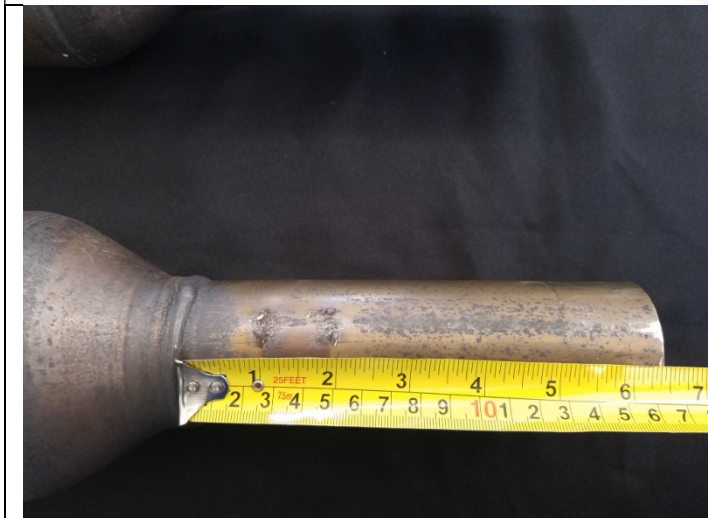
14. Factory Mid Pipe will have to be cut. Measure 6.50" from the weld and cut either with a sawz-all or die grinder.