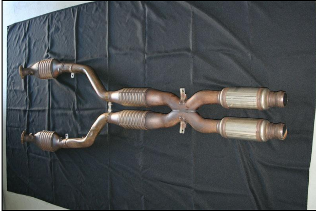
Factory exhaust removed