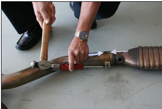
Using a hammer, remove the factory support brace