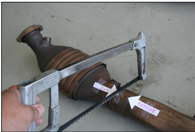
Making the cut on the DRIVER side